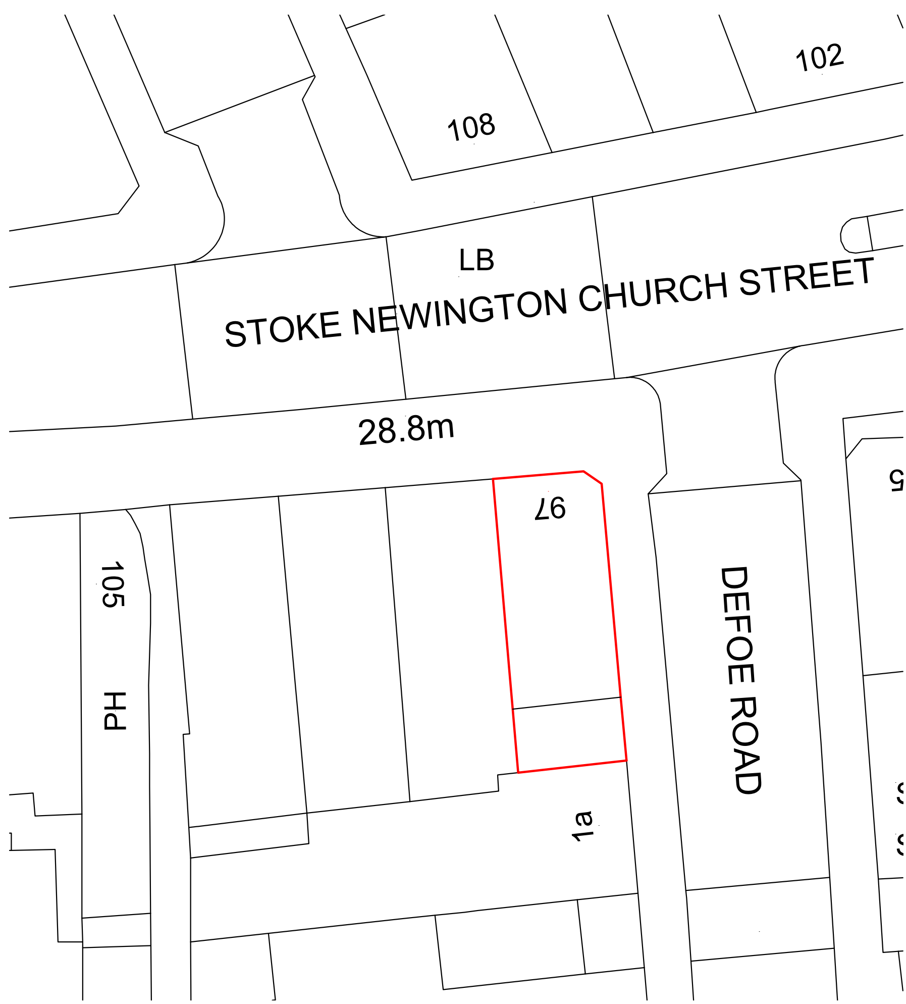
BLOCK PLAN SCALE 1 : 200