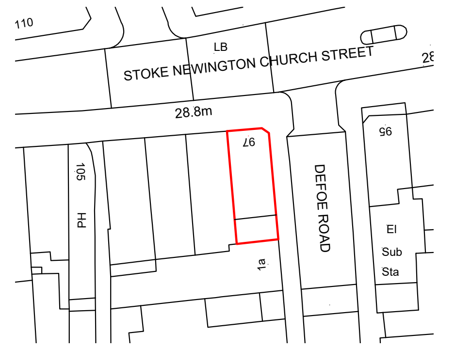
SITE PLAN SCALE 1 : 500